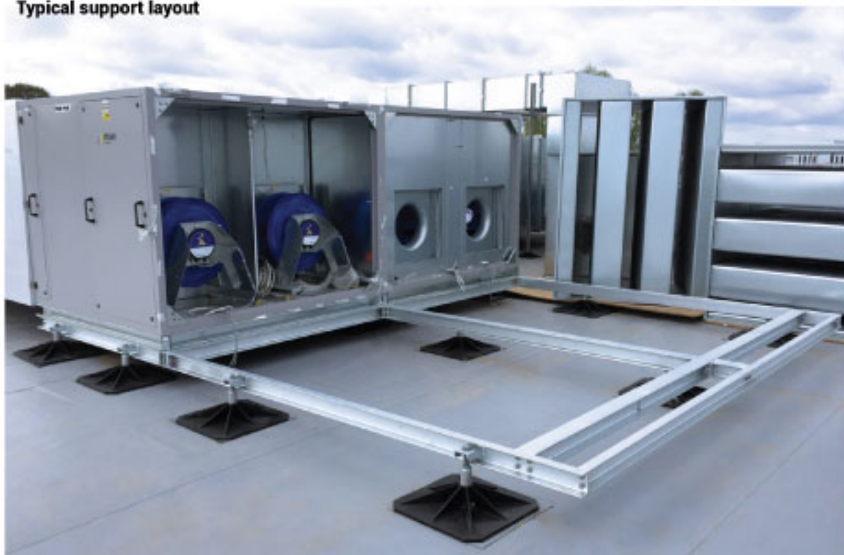
Typical support layout

These custom solutions are frequently manufactured from 100 x 50mm parallel flange channel and/or 100 x 100mm HEB (European beam) and supported off fully adjustable leg assemblies utilising our larger 500 x 500mm polypropylene feet incorporating anti-vibration rubber mats adhered to the underside. However larger steel sections are available dependant on project requirements and/or the mass or size of the services being supported. All frameworks are finished hot dip galvanised and supplied with all fixings. We will provide the design team with an AutoCAD drawing proposal together with load calculations prior to manufacture.