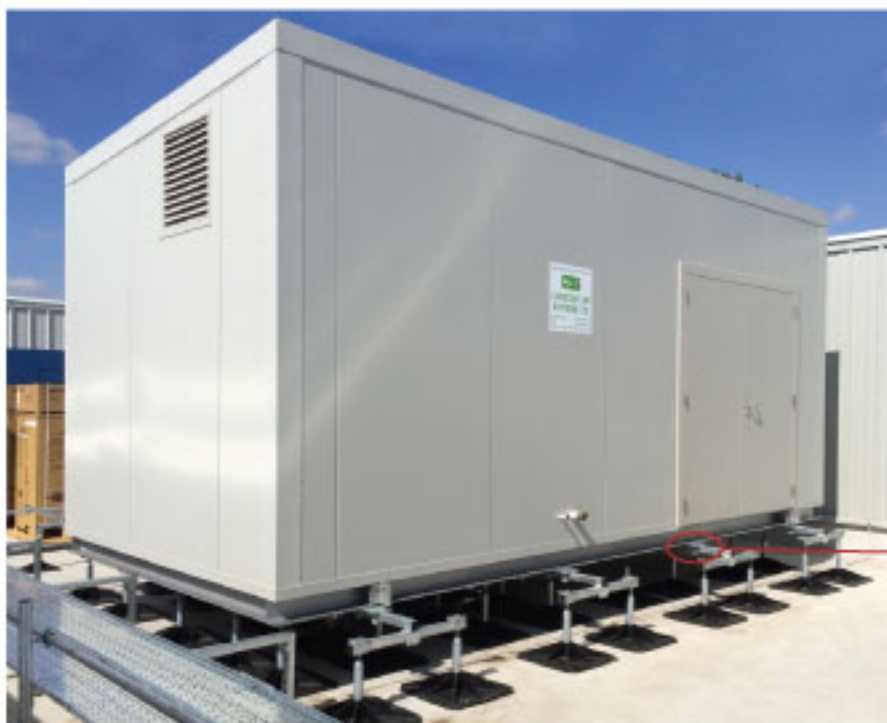
Typical plantroom support utilising 8no. F-QUAD-500-A

The TWIN/QUAD adjuster (below) is an optional extra that can be purchased either with or without the secondary upper M16 mounting plate