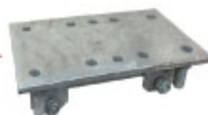
Single Mounting Plate Part Code - F-TQ-ADJ-S