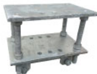
Double Mounting Plate Part Code - F-TQ-ADJ-D

The TWIN/QUAD adjuster (below) is an optional extra that can be purchased either with or without the secondary upper M16 mounting plate